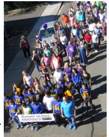
More than 100 showed their support

fortunately there are still many people who seem to think it only happens elsewhere. Last year we provided advocacy services for 139 survivors and that number may rise even higher for 2014.