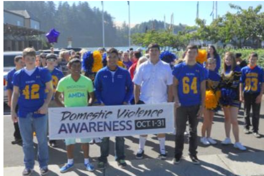
Members of Siuslaw High School Football, Volleyball and Cheerleading Teams led this years march